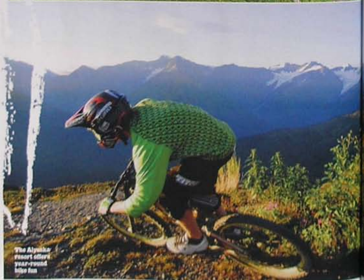
The Alyeska resort offers year-round bike fun

"The scenery blew us away," recalled Wellburn. "The glaciers on the top of the mountains splay out into these crazy boulder fields, which then transition into the greenest slopes before they disappear into the tree line." ❧