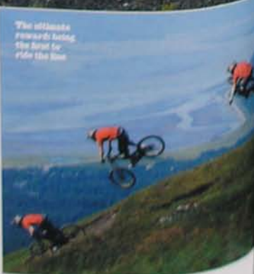
The ultimate reward: being the first to ride the line

"I immediately began deploying evacuation procedures, trauma kits, EMTs and triple checked all the waivers! I watched as the best prices were nailed