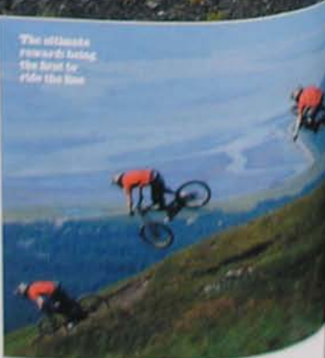
The ultimate reward: being the first to ride the line

"I immediately began deploying evacuation procedures, trauma kits, EMTs and triple checked all the waivers! I watched as the best pits were nailed